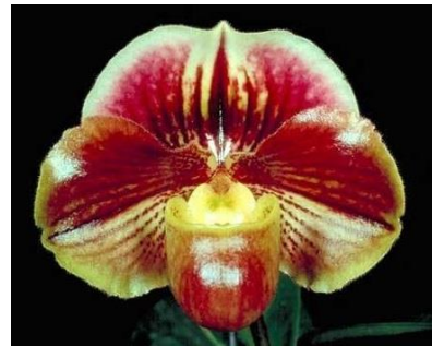
Paph. Ali Taba 'Elite' HCC/AOS

The non-complex/standard shape parent in such hybrids will be either a species, e.g. Paph. fairrieanum as in Paph. Oto (Winston Churchill x fairrieanum ) or a novelty/other type hybrid.