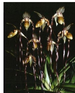
Paph. Michael Koopowitz 'Sam's Spirit' AM/AOS