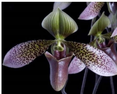
Paph. Nisqually 'Asuko' AM/AOS