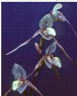
Paph. Saint Swithin 'Sunnybank' FCC/AOC