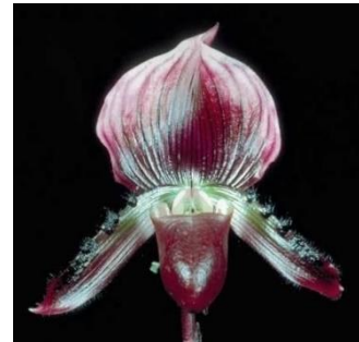
Top of dorsal sepal with a "soft serve ice-cream curl" appearance

Examples of breeding achievement with Maudiae-type hybrids are depicted here with the likes of: Paph. Nettie McNay 'Anemone' AM/AOS, Paph. Flame Arrow 'Wide Wide Petals' HCC/AOS, and Paph. Maudiae 'Magnifique' HCC/AOC.