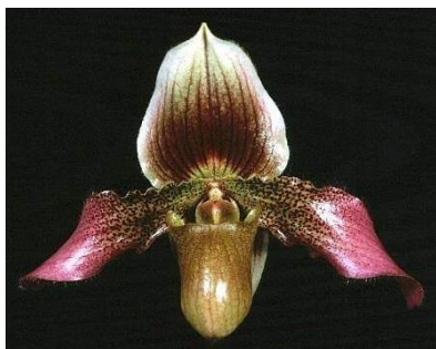
Paph. Jewelled Tapestry Amethyst 'HCC/AOS

Paph. Jewelled Tapestry ( acmodontum x hirsutissimum ), Paph. Papa Röhl ( sukhakulii x fairrieatum ) and Paph. Double Deception ( venustum x sukhakulii ) are examples of primary hybrids. Further examples of primary hybrids can be found in the examples for §6 Hybrids with Significant Brachypetalum Influence, §7 Hybrids with Significant Parvisepalum Influence and §9 Intersectoral Hybrids.