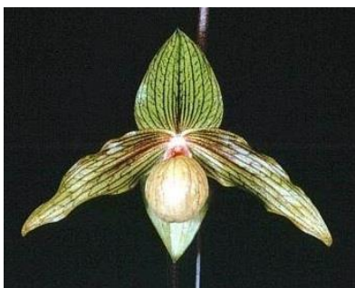
Paph. Harold Koopowitz

While intersectional crossings between vastly dissimilar sections might produce problematic progeny, some very outstanding and promising results are achievable. Paph. Harold Koopowitz ( malipoense x rothschildianum ) and Paph. Krull's Lace ( Fanaticum x rothschildianum ), both 50% parvisepalum and 50% Section Coryopedilum, are examples.