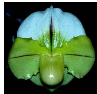
Paph. Baroness 'Marie' AM/AOC

Additionally, their segments, which must not display any sign of limpness, should be in proportion, in form and not reflexing at the edges.