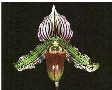
Paph. Papa Röhl 'Billy's' HCC/AOS