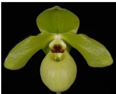
Paph. Envy Green 'Springwater' HCC/AOS

There are many successful 50% parvisepalum grexes like Paph. Envy Green ( malipoense x primulinum ) and Paph. Pink Sky ( delenatii x Lady Isabel).