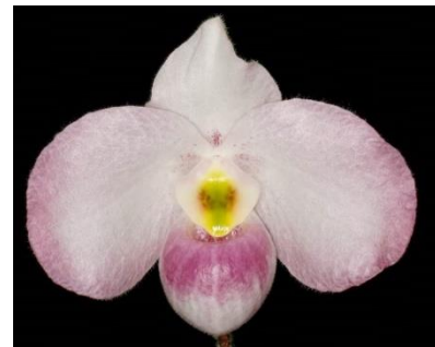
Paph. Ho Chi Minh 'Vietnamese Vision' AM/AOS