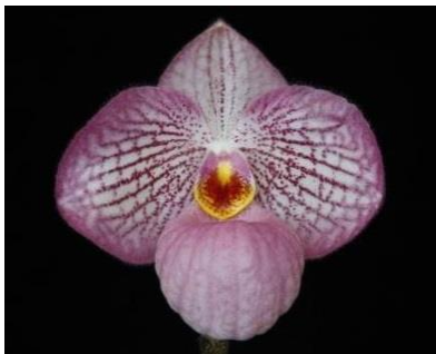
Paph. Magic Lantern 'Pink Lantern' AM/AOS

Paph. Magic Lantern ( micranthum x delenatii ), Paph. Fanaticum ( malipoense x micranthum ), Paph. Ho Chi Minh ( delenatii x vietnamense ) and Paph. Anni Fuchs ( vietnamense x hangianum ).