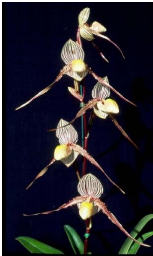
Paph. Saint Swithin 'Sunnybank' FCC/AOC Natural Spread: Height: 120mm Width: 263mm

The natural spread of flowers with long pendulous petals depends on the angle at which the petals are held, even for the same grex.