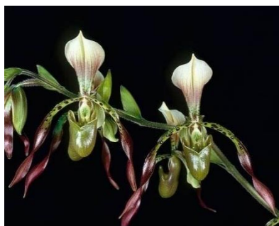
Paph. Bengal Lancers 'Sunset Valley Orchids' HCC/AOS