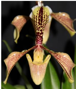
Paph. villosum var. boxallii