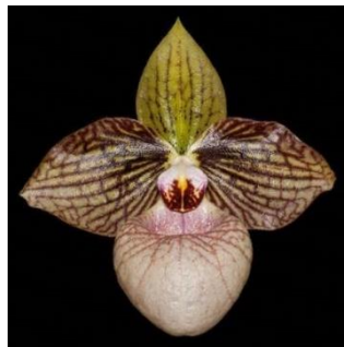
Paph. Fanaticum 'Perfect Color' AM/AOS