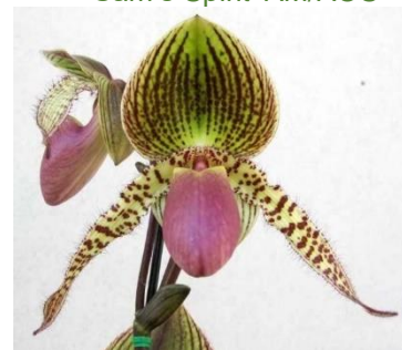
Paph. Vanguard 'Beau' AM/AOC