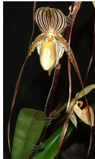
Paph. Saint Swithin 'John's Gift's' AM/AOC Natural Spread: Height: 231mm Width: 148mm

The number of flowers and the size should be assessed against the geometric mean of the expectation of the parents.