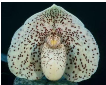
Paph. Bella Lucia 'Big Butter Pat' HCC/AOS

Paph. Bella Lucia ( bellatulum x Wellesleyanum ), Paph. Iona ( bellatulum x fairrieanum ), Paph. Kevin Porter ( bellatulum x micranthum ) and Paph. Psyche ( bellatulum x niveum ).