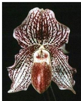
Paph. Paph Iona 'Sultanesque' HCC/AOS