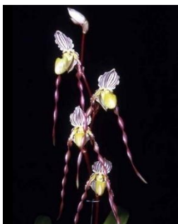
Paph. philippinense var. roebelinii 'Grace'