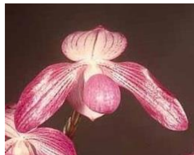
Paph. Pink Sky 'HOF #21' HCC-AOS

Benchmarks need to be used where they exist and especially where standards have been established by previous awards. Ongoing improvement over previously awarded cultivars is to be expected. For judging unfamiliar hybrid grexes and crossings and to establish the appropriate level of an award under consideration, computer-based and on-line referencing of orchid award data is necessary.