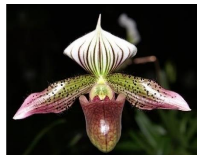
Paph. Makpurp '#2'