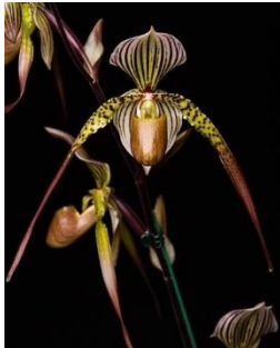
Paph. Saint Low 'Asheville' AM/AOS

As stated earlier on, the general criterion should be favourable comparison with previously awarded cultivars and/or general improvement over contributing, ancestral species and grexes. With such hybrids, the influences of the ancestral species involved may or may not be easily identifiable. Some