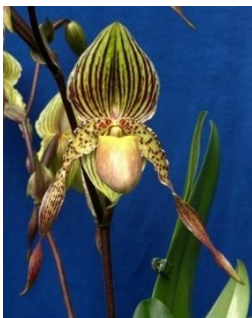
Paph. lantha Stage 'Jade Dragon' HCC/AOS