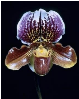
Paph. Oto 'The Red King' HCC/AOS

Both Paph. Oto (Winston Churchill x fairrieanum ) and Paph. Aliba Taba (Paeony x fairrieanum ) are hybrids that fit this category.