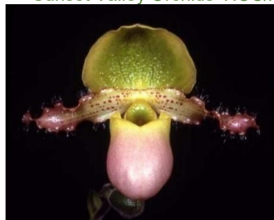
Paph. Pinocchio 'Dew Kiss' BM/CSA