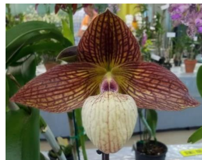
Paph. Krull's Lace

It is important to know the number of blooms to expect for intersectional hybrids. For Paph. lantha Stage ( sukhakulii x rothschildianum ), two or three blooms would be impressive. For the likes of a progressive flowering multifloral crossed with a simultaneously flowering multifloral, inflorescences of four or five blooms with two or three blooms open simultaneously could be expected. Consider the exhibit of Paph. Mary Franz Smith 'Marlene' AM/AOC ( glaucophyllum x Saint Swithin ) awarded in 2010. It had two spikes, one with three blooms open and the other with two blooms open.