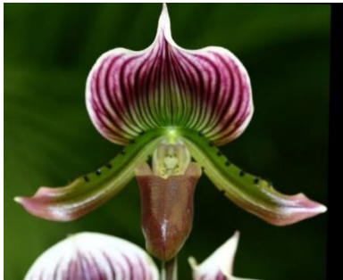
An excessively pointed dorsal sepal