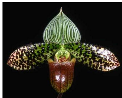
Paph. Double Deception 'Dots Incredible' HCC/AOS