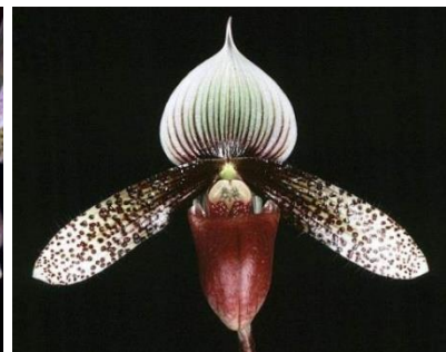
Paph. Oriental Spice 'ETO' HCC/AOS

Utilising benchmarks for a particular exhibit or similar types of hybrids together with on-line research of the grex to be judged is the chief aid. Knowledge of an exhibit's parentage, and perhaps even its ancestry, together with a knowledgeable application of the Basic and Principal Criteria for judging quality awards should guide judges here. Undesirable characteristics, such the significant reflexing of the sides of the dorsal sepal, as with Paph. purpuratum (that would be acceptable in the straight species and in a primary hybrid) should be largely bred out in the next hybridizing step.