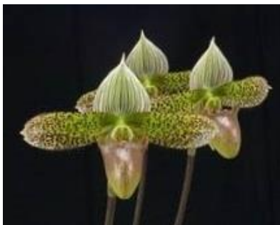
Paph. Love Song Amethyst 'HCC/AOS

All hybrids depicted in subsequent categories, except for §11 Hybrids with Just One Parent a Complex/Standard Shape Type Hybrid, are also examples for this category. Following are a couple of examples of novelty/other type hybrids that do not qualify for any of the subsequent categories.