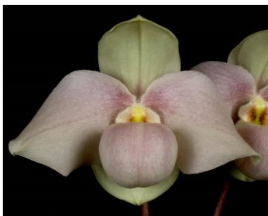
Paph. Anni Fuchs 'Springwater' HCC/AOS

There are many successful 50% parvisepalum grexes like Paph. Envy Green ( malipoense x primulinum ) and Paph. Pink Sky ( delenatii x Lady Isabel).