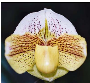
Paph. Lady Luck 'No. 2'