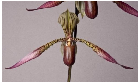
Paph. Saint Low 'Nike II' AM/AOS

hybrids might be only one step removed from a primary hybrid such as in the case of Paph. Saint Low ( Paph. Saint Swithin x Paph. lowii ). These adjacent two Paph. Saint Low cultivars depict very well the variance in outcomes possible for the same grex.